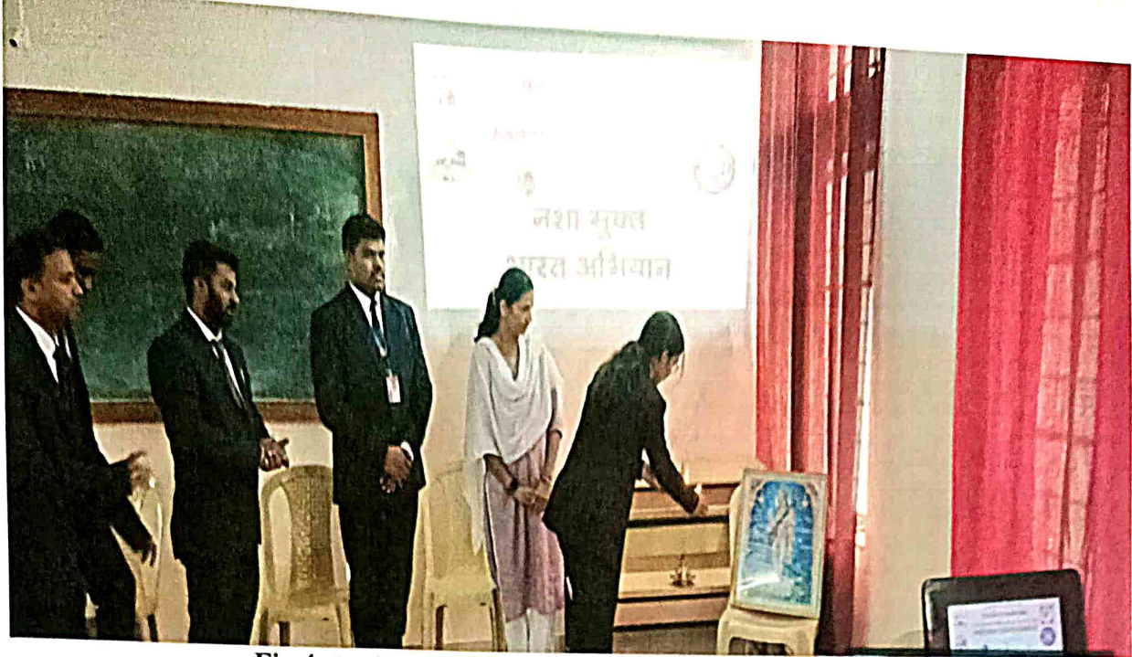
Fig.4: Students participating in the inauguration session